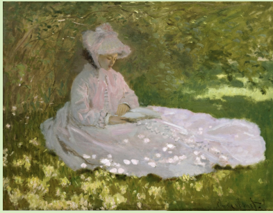
Springtime by Claude Monet (1872)

Visit RAL Art Center this month and enjoy the Sky's the Limit exhibit AND the third annual Art in Transit show and reception (at which the winning piece of art will be "unveiled" by being displayed for the first time on the side of a Bay Transit bus!).