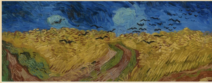
Vincent van Gogh, Wheatfield with Crows , 1890