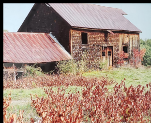
Barn Dressed for Fall by Gayle Werling