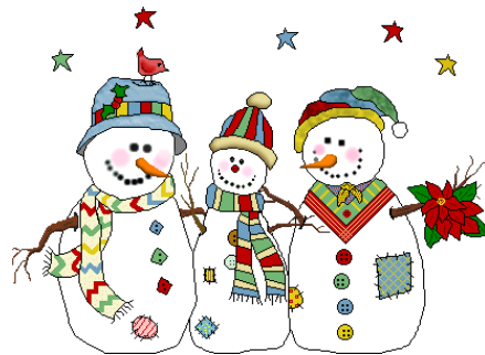
Exhibit Dates: Tuesday, November 21 through Saturday, December 30

Receiving: Monday, November 20 from 10 am to 2 pm