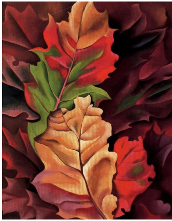
Autumn Leaves by American artist Georgia O'Keeffe in 1924

Visit RAL in October and enjoy two beautiful exhibits highlighting the arrival of Fall and the remarkable colors of nature. You won't want to miss these popular shows!