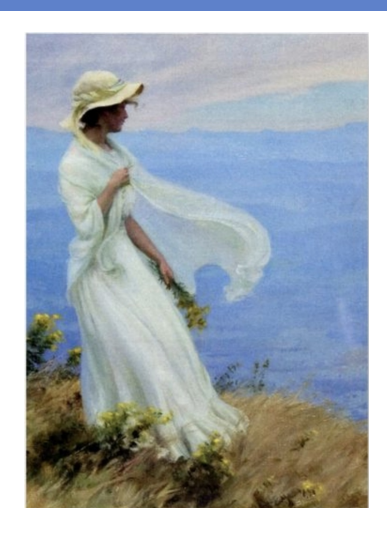
September Afternoon by American artist Charles Courtney Curran

Visit RAL in September and enjoy the world-famous (OK, OK, make that Virginia-famous!) Labor Day Art Show! Join us at the First Friday Reception on September 1st as we announce and celebrate all the winners and participating artists.